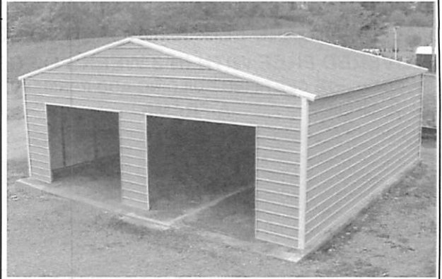
RANCH STYLE HAS VERTICAL ROOF AND HORIZONTAL SIDES

HANDI-PORT GARAGES HAVE BEEN MADE IN KENTUCKY FOR OVER 25 YEARS